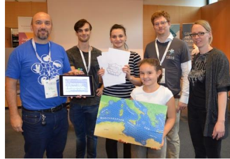
Figure 1 Design team

Seawatch 1 is a game where players are captains of small vessels cruising the Mediterranean Sea and eventually rescue people in distress, which turn out to be refugees from different backgrounds. Then players try to bring them into one of six ports (Alicante, Marseille, Thessaloniki, Crete, Malta, Lampedusa), however it is often difficult to get permission to enter when having refugees on board. Thus, players have to be persistent at a port or trying to get to another one in time. People brought safely into a port are counted as winning points for a player, people who die while being under the responsibility of a player are counted as negative points. The player who first reaches 10 or more points wins the game.