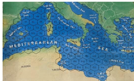
Figure 2 Game board