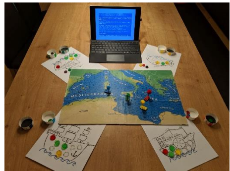
Figure 3 Game setup